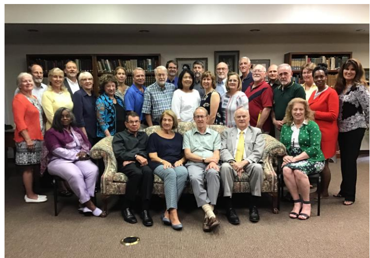
Members and Guests at the Christian Education Summit I